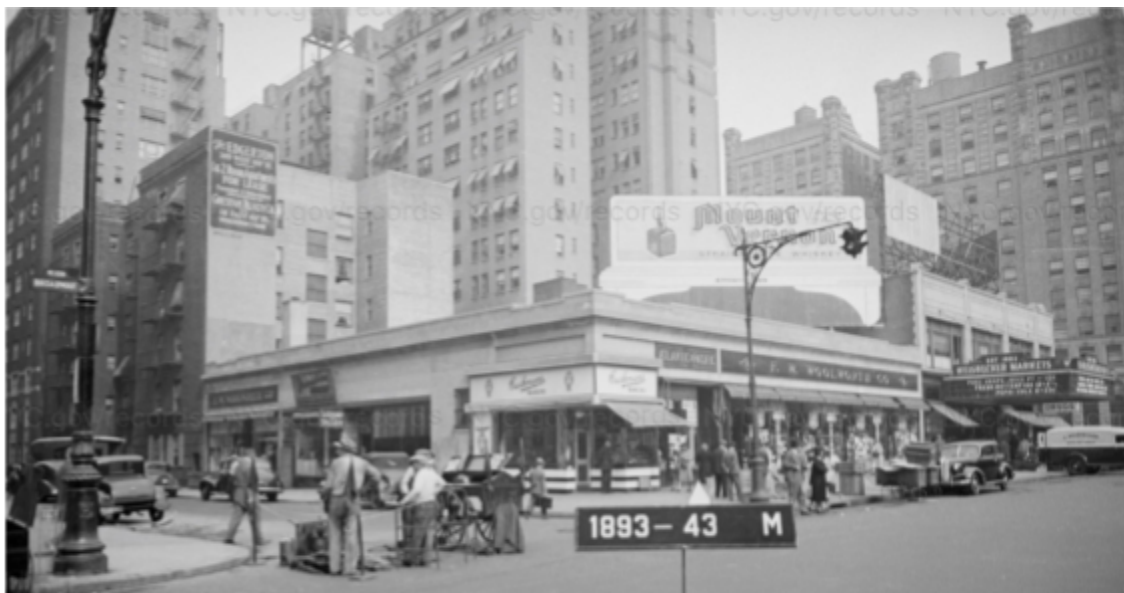
109th Street and Broadway, looking north, 1940

And who doesn't love to look at then-and-now comparisons for the block you walk on every day? The City of New York obligingly photographed nearly every building in all five boroughs in 1939-1940 , and again in the early 1980s , making it easy to create your own then-and-now pairs.