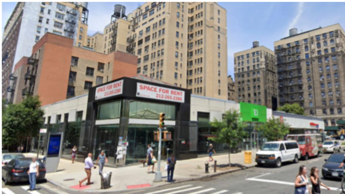
109th and Broadway today

Get started today! There's a wide range of choices for documenting what you find, from video presentations or panel displays like Jim and Rob created, to blog posts or dedicated websites. Share your discoveries with your neighbors and with us at the Bloomingdale Neighborhood History Group.