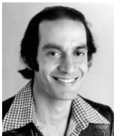
Gregory Joseph Sierra

Sierra was a regular on the television sitcoms "Barney Miller" and "Sanford and Son." He was also a constant presence in such shows as "Soap," "Hill Street Blues," "Miami Vice," and "Murder She Wrote." He was born in Manhattan and raised in Spanish Harlem.