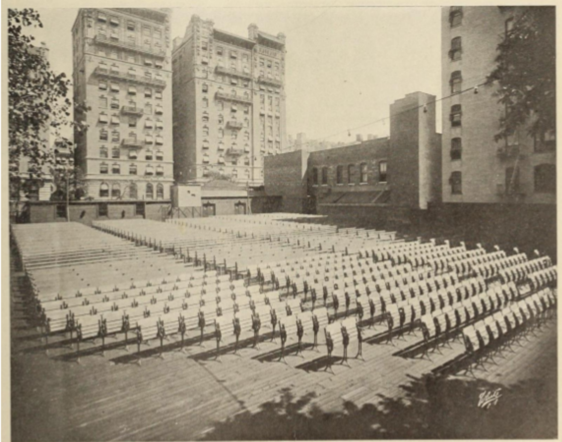
Moorish Gardens Theater on 110th Street, 1913

And who doesn't love to look at then-and-now comparisons for the block you walk on every day? The City of New York obligingly photographed nearly every building in all five boroughs in 1939-1940 , and again in the early 1980s , making it easy to create your own then-and-now pairs.