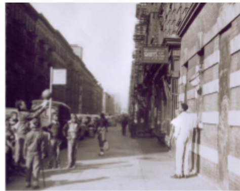
A game of basketball being played on the street corner at West 99th Street near Central Park West.

The audience saw an illustrated history of the 50-year period documenting the life of the residents, businesses, and activities of this close-knit enclave.