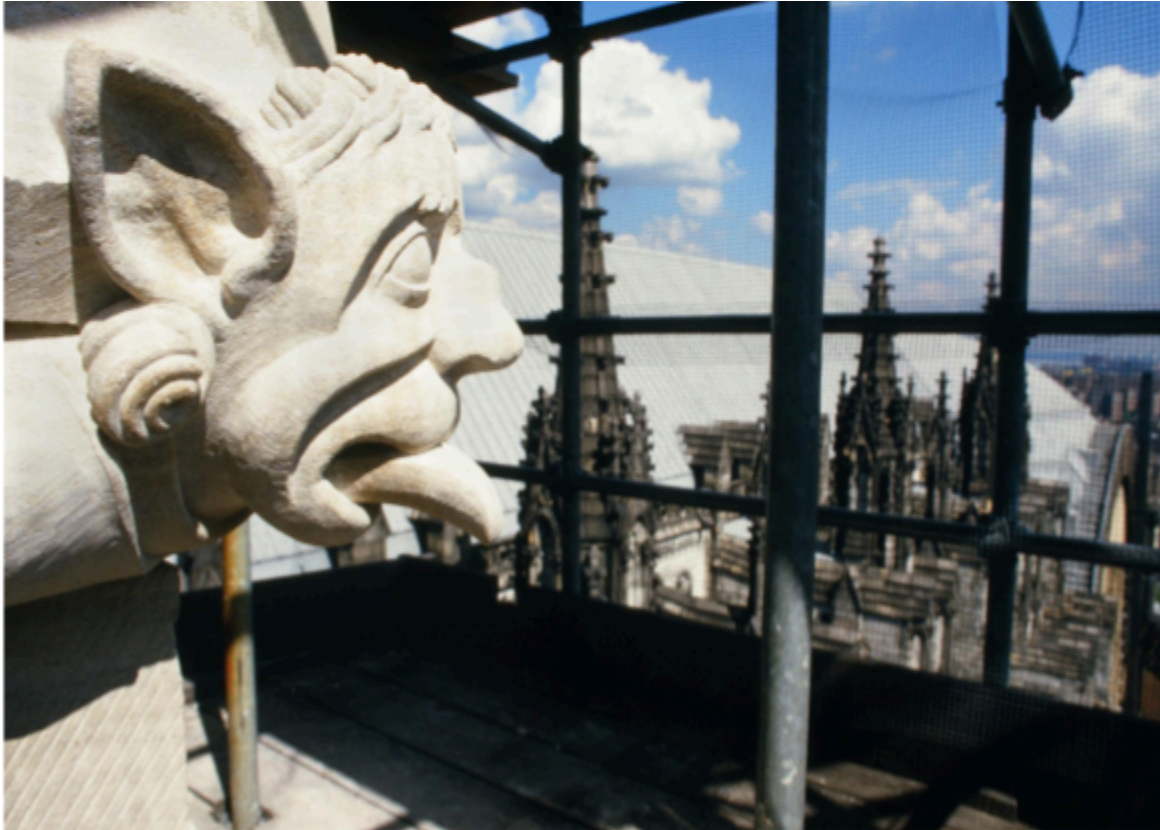
Carving in place atop tower.

Forty years ago, the Cathedral of St. John the Divine undertook a major project to build its long overdue towers. That they were never completed earned the church the nickname St. John the Unfinished. What most people don't realize is that the partially built south tower is host to an extraordinary array of exquisite stone sculptures – not readily visible from street level.