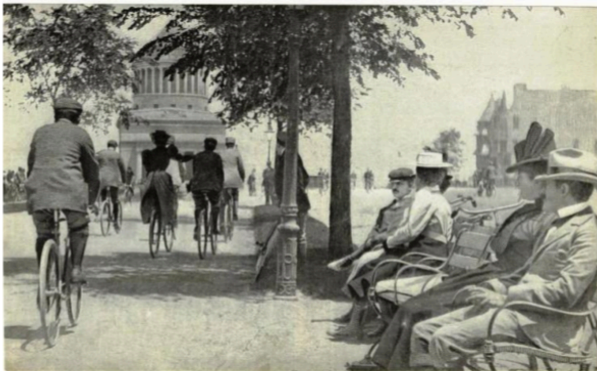
Cyclists on Riverside Drive

In the 1890s, a bicycling craze swept America as men and women purchased bicycles and took to the roads. The safety bicycle, a machine much like the one we have today with equal-size wheels and inflated tires, fueled the craze as the model became widely available by the mid-1880s. Bicycles cost from $45 to $75, making the craze very much a middle-class phenomenon.